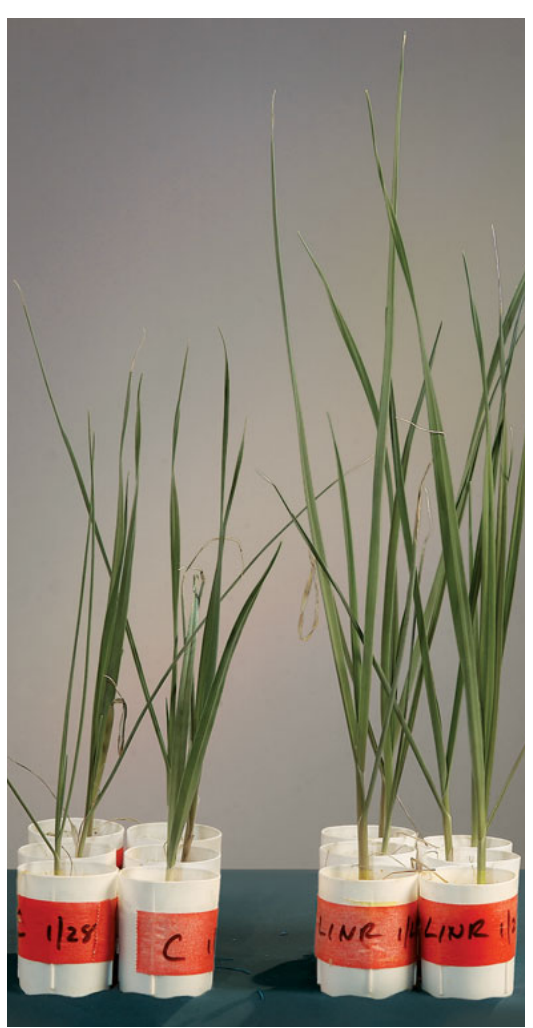
Leeks without hyphae, and with hyphae